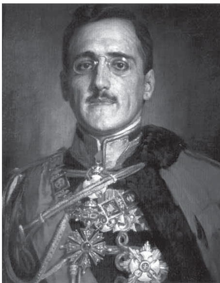
King Alexander I

King Alexander I, King of Yugoslavia, was the second son of King Peter I and the Montenegrin Princess Zorka; he was born in Cetinje, Montenegro 16 December 1888. His Godfather was Tsar Nikola II of Russia. He spent his childhood in Montenegro and was educated in Geneva. He continued his education at the Military School in St. Petersburg, and then in Belgrade, after King Peter I ascended the Serbian throne.