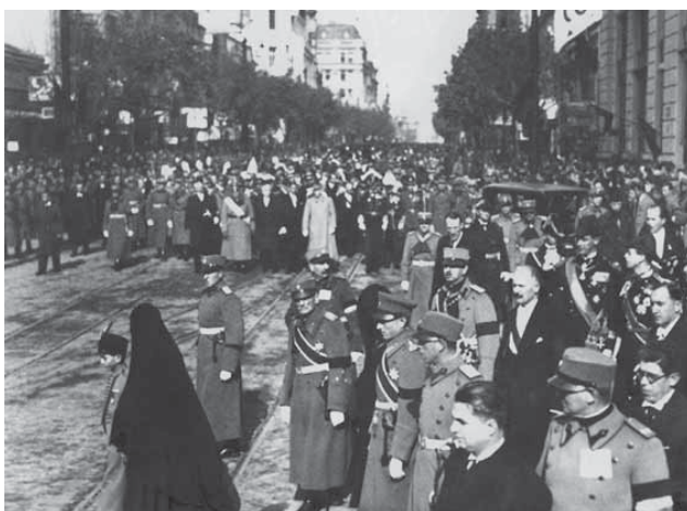
Queen Maria and King Peter II in front of the walk to the grave

Around midnight on the 15th October the King's body reached Belgrade where it was met by around 100.000 people. They carried him to the big Hall in the Old Palace. The coffin lay in state there on the 16th and 17th October. The estimation was that around 600.000 people from Belgrade and other parts of the country came to see it. On the 17th October, just before midnight, the coffin was transferred to Saborna Crkva, where Patriarch Varnava with bishops held the funeral service. High officials and foreign representatives were present at the service. After the funeral service, a procession, lead by the Queen and King Peter II set off toward the Train Station, where the body was embarked on the train. From Mladenovac to Topola the coffin was met by more than 500 kneeling people, mostly farmers. The