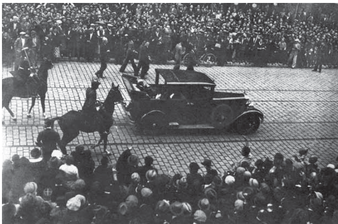
The car in which King Alexander and Luy Barton left the port a couple minutes before the assassination

It was known in Belgrade that preparations for the assassination attempt were under way but the King refused to take the warnings seriously and others in charge of his security did the same. Before setting off the King was nervous and tired; he was feeling ill, his weight was only 49 kilograms. Instead of going on the trip he should have undergone medical treatment. The atmosphere on board of “Dubrovnik” was sombre, the assassination attempts were also discussed; Queen Maria requested that the King wear a bullet proof vest, but he refused. The Queen decided not to sail. Poor weather in Herceg Novi at the time of King Alexander’s departure was not a good omen. For two days the weather was windy and only on the 9th October the sun came out. Accompanied by a French destroyer, “Dubrovnik” sailed in to Marseille around 3:30pm. Meanwhile information had reached Paris that assassins were in the port. The Marshall of Court, General Dimitrijevic, advised King Alexander not to disembark, but he refused the suggestion. The reception on shore was magnificent and gun salutes welcomed the King. The crowd was huge on shore and surrounding the ship.