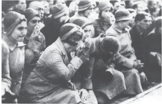
The crying and mourning of people

The assassination in Marseille had a huge echo throughout the world and it was considered as a heavy hit for European peace. Mourners at the funeral included the French President Lebrun and Marshall Pétain, Britain's Duke of Kent (later King George VI), King Carol of Rumania, Prince Kyril of Bulgaria, Prince Paul of Greece (later King Paul of the Hellenes), Archduke Anton of Austria, the President of the German Reichstag, Herman Goering, Italian Duke of Spoleto and many others. The Russian Minister Maxim Litvinov said that the late King was the most decisive supporter of European peace. The Ecumenical Patriarch had words of praise for the late king too.