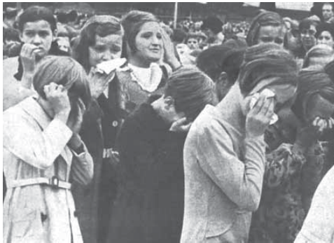
People mourn their King

Although the French police obtained from the arrested assassins a confession that they had been hired by Pavelic and Eugene Kvaternik and requested their extradition, the Italian government was not prepared to accept the request. The Yugoslav government announced to the world that Italy was the source of terrorists and originator of the assassination. Pavelic and Kvaternik were arrested. Mussolini convinced the French and British governments that Italy had nothing to do with the assassination and that the Yugoslav accusation was unfounded. The sharpness of the accusation was made blunt. The whole process of investigation was stopped in the mud of empty phrases and lies. France admitted her responsibility for the assassination, but everything ended there. The British government took a similar stand, and that was confirmed by ministers Anthony Eden and John Simon.