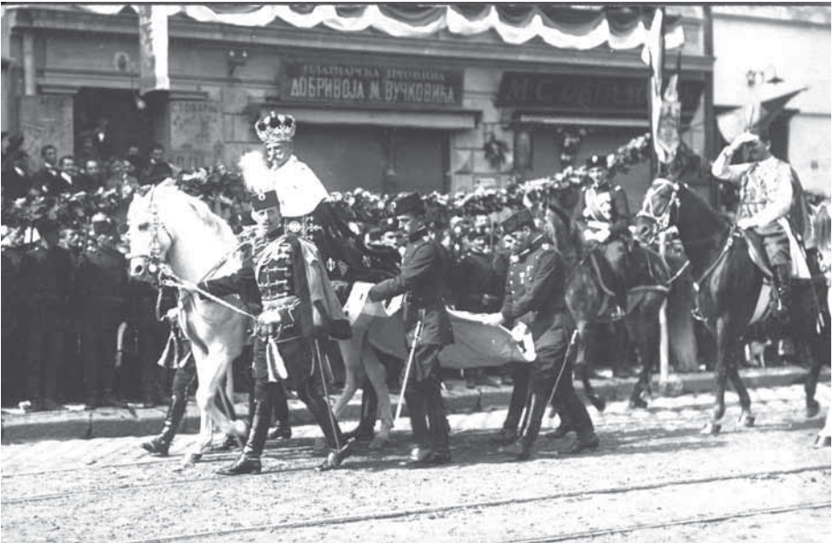
Return of the King's cortege to the Palace after the coronation, 21 september 1904

Coronation and anointment is a complex act of consecration with which the sovereign, who has already been invested with actual state power, solemnly takes the royal insignia, regalia, and becomes God's anointee. Coronation is the ritual unlike anointment which is a holy secret. Coronation and anointment can be performed as part of a unique act of ruler's consecration or be separated in time and place. As part of a historical practice some rulers were consecrated only by coronation or anointment, or they simply ascended throne with neither of them but with a formal procedure that was at the time and place adjusted to