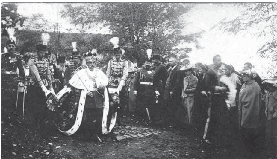
HM King Peter I during the anointment ceremony in Zica monastery, 9 october 1904

The act of anointment, as complementary to the coronation act, in its essence is incomparably more significant in the spiritual and religious respect. As a part of the medieval Serbian act a ruler would bow his head to the celebrant (Arch Hierarch) who would say a prayer for anointment, mentioning prophet Samuel and the Old Testament emperor David.